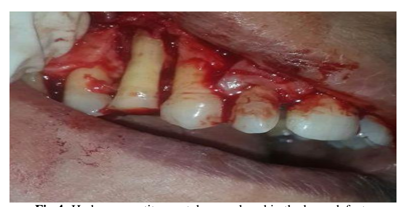
Fig 4: Hydroxyapaptite crystals was placed in the bone defect.